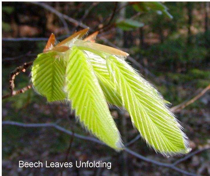
Beech Leaves Unfolding