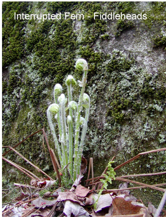
Interrupted Fern - Fiddleheads

Minuteman Bicycle Path and Hanscom Air Base/Field would be reserved for vehicles turning left into one of the many entrances to commercial establishments, and the space of the former fourth lane would be reserved for safe use by cyclists and walkers. Many people using these environmentally-friendly means of transportation can now be seen competing with vehicles at lunch or commuting times. Unfortunately, accomplishing this low-budget traffic-calming device has been slowed by change of personnel in the DPW's engineering staff and scarcity of money.